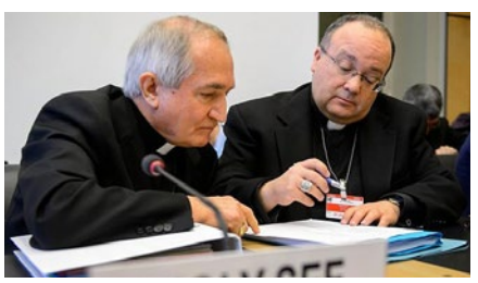
Holy See representatives at the UN hearing

There was also harsh criticism, and action called for, relating to the Church's "removal of babies from their mothers" and selling them for large sums to foster parents. The babies were mainly from Spain, but also from the Magdalene Laundries in Ireland (as depicted in the recently-released film Philomena ), whose forced labour was also the subject of a lengthy section on torture