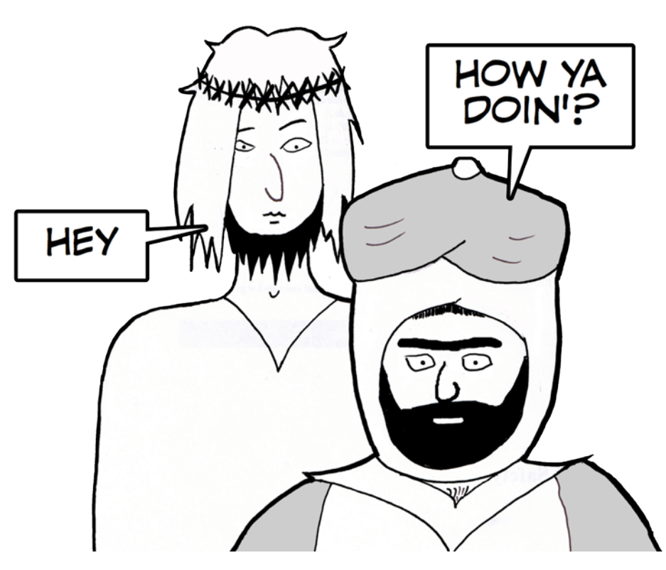
Jesus and Mo

The National Secular Society is at the forefront of challenging this increasing climate of censorship demanded by the reactionary views of religious extremists who are encouraged by the willingness of un-thinking apologists to accommodate.