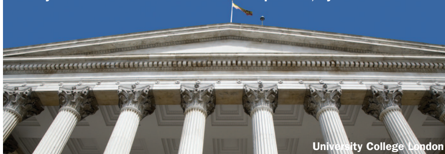
University College London