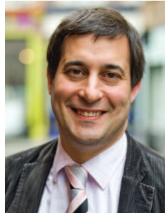
Dr Evan Harris MP

We are greatly indebted for help from the JCHR, the Liberal Democrats front bench – and in particular Dr Evan Harris, MP.