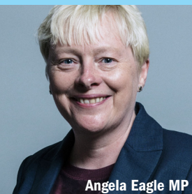
Angela Eagle MP